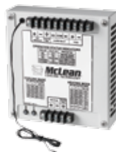
Thermoelectric temperature controller