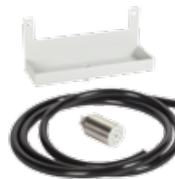
Thermoelectric condensate manager